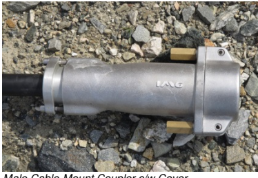
Male Cable-Mount Coupler c/w Cover